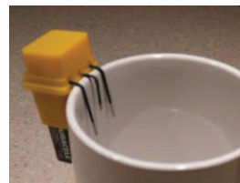
Liquid Level Indicator

Below: a small sampling of items in the Sight Shoppe catalog.