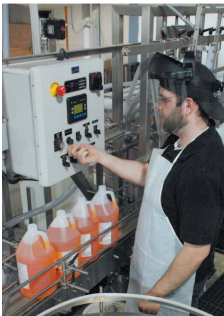
Packaging green cleaning products in CABVI's Central Industries.

Greening the Cleaning® means eliminating, to the greatest extent possible, all cleaning agents containing hazardous ingredients and replacing them with naturally-derived ingredients possessing the least level of toxicity. One hundred percent of all surpluses from sales of the institutional products go to two entities: the Central Association for the Blind and Visually Impaired, to provide employment opportunities and vision rehabilitation services to people who are blind or visually impaired in central New York, and The Deirdre Imus Environmental Center for Pediatric Oncology®, supporting education and research to identify, control and ultimately prevent exposures to environmental factors that may cause adult, and especially, pediatric cancer, as well as other child health problems.