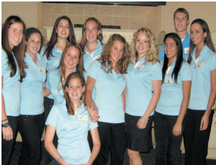
Hamilton and Utica College students who volunteered at Dark Dining.